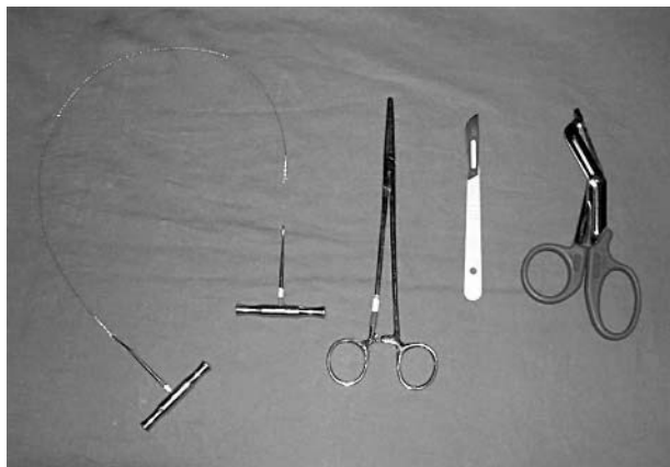
Figure 1 Equipment: Gigli saw, large clamp/forceps (or equivalent), large scalpel, and large scissors.