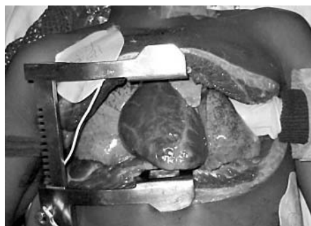
Figure 3 Open chest. Rib spreaders in situ. Central heart. In this picture the pericardium has been displaced by internal cardiac massage and lies behind the heart. Gloved hand compressing the aorta.

The procedure and equipment used to perform a thoracotomy in a cardiothoracic operating theatre is highly specialised. To