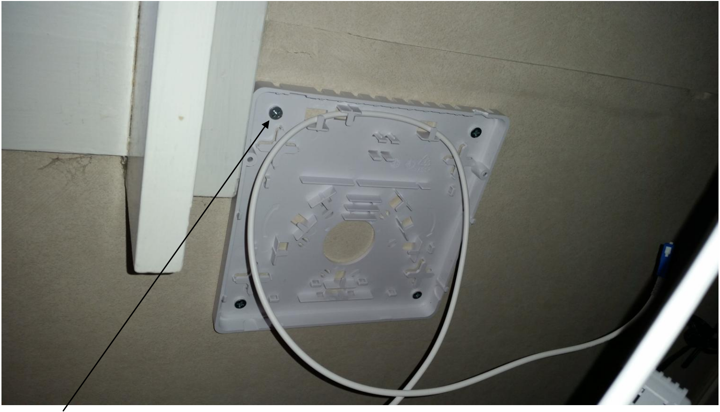
Figur 1.Skruva fast vägg fästet med 4 skruva