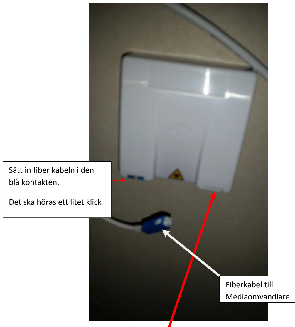
Figur 2. Fiberanslutnings box in sida hus vägguttag