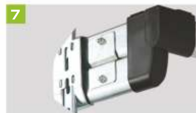
PVC cover of the edges and corners protects against injury