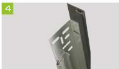
Thermal profile between the wall and guides

Sheet steel coated with anti corrosion primer and white lacquer