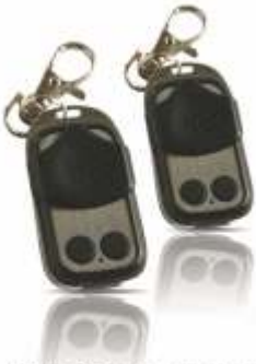
2 remote controls