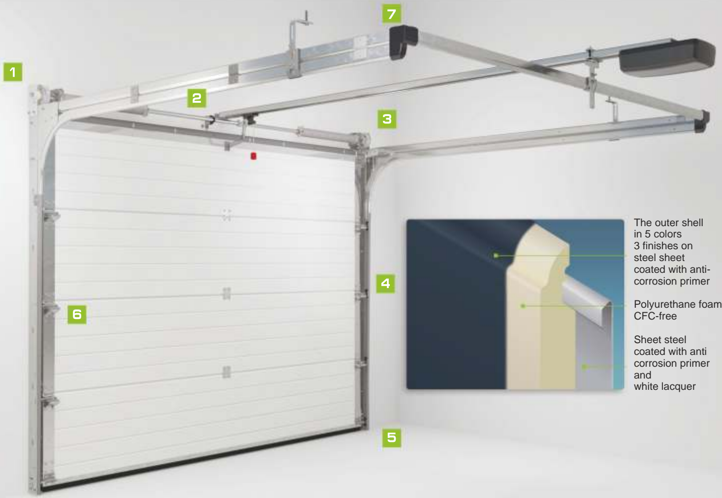
Anti-fall device in spring break emergency

The outer shell in 5 colors 3 finishes on steel sheet coated with anti-corrosion primer