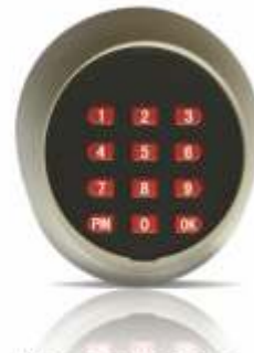
Wireless code lock