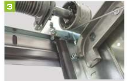
Cast arches tracks for secure locking of top panel