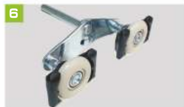
Double ball-bearing steel roller covered teflon with protection against finger-clipping