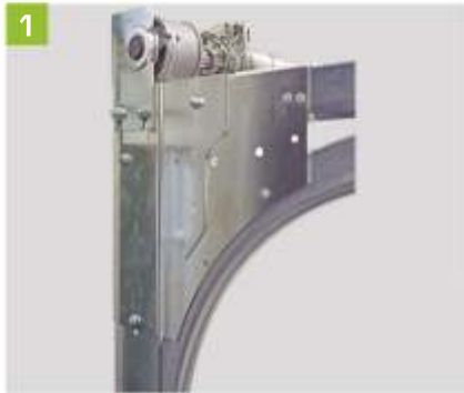
Track curves strengthened by steel plate