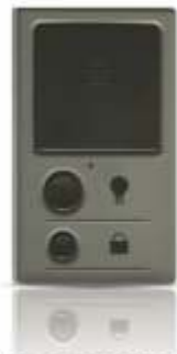
Wireless wall switch