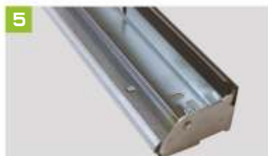
Bottom base made of stainless steel