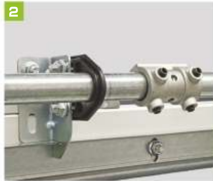
Shaft coupler for precise balance