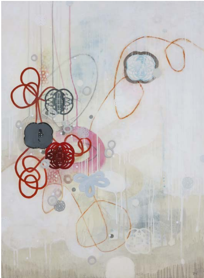
EBULLIENCE 1, 2012, ACRYLIC AND MIXED MEDIA ON PANEL, 102 X 76 CM (40 X 30 INCHES)