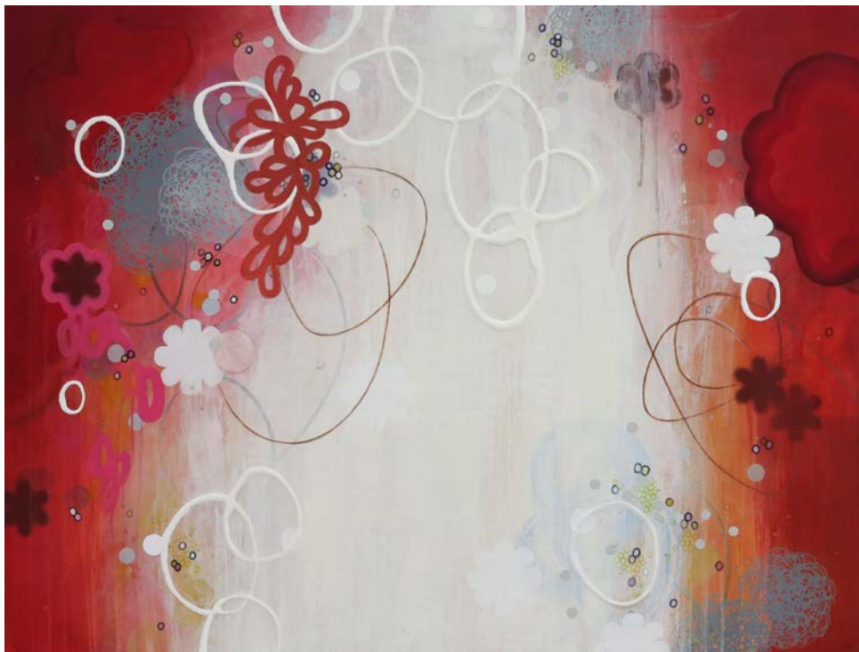
REVELRY, 2013, ACRYLIC AND MIXED MEDIA ON PANEL, 91.5 X 122 CM (36 X 48 INCHES)