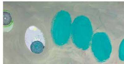
STILL IMAGES FROM VIDEO ANIMATION, COLORCAST, 2013