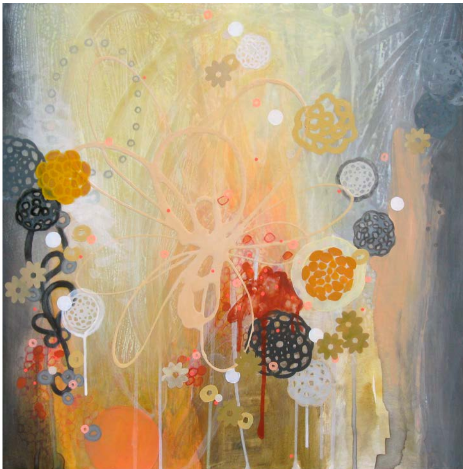
YELLOW BLOSSOM, 2012, ACRYLIC AND MIXED MEDIA ON PANEL, 81 X 81 CM (32 X 32 INCHES)