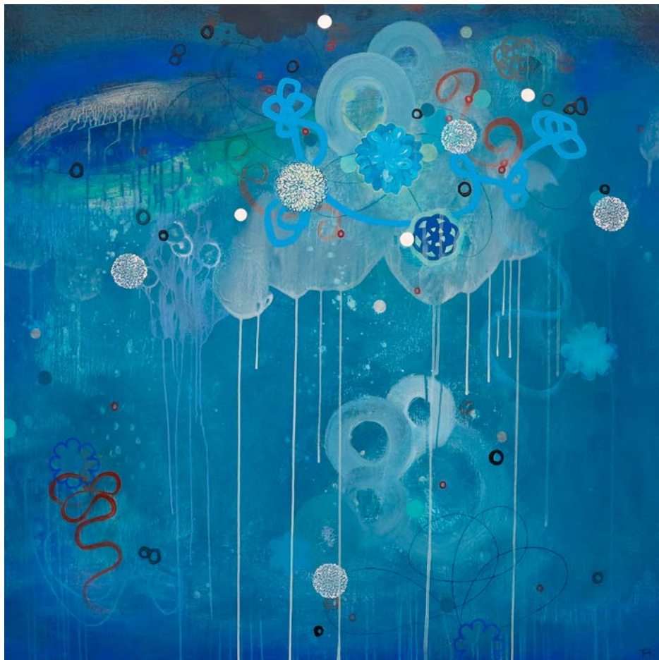
CROSSING THE OCEAN, 2013, ACRYLIC AND MIXED MEDIA ON PANEL, 122 X 122 CM (48 X 48 INCHES)