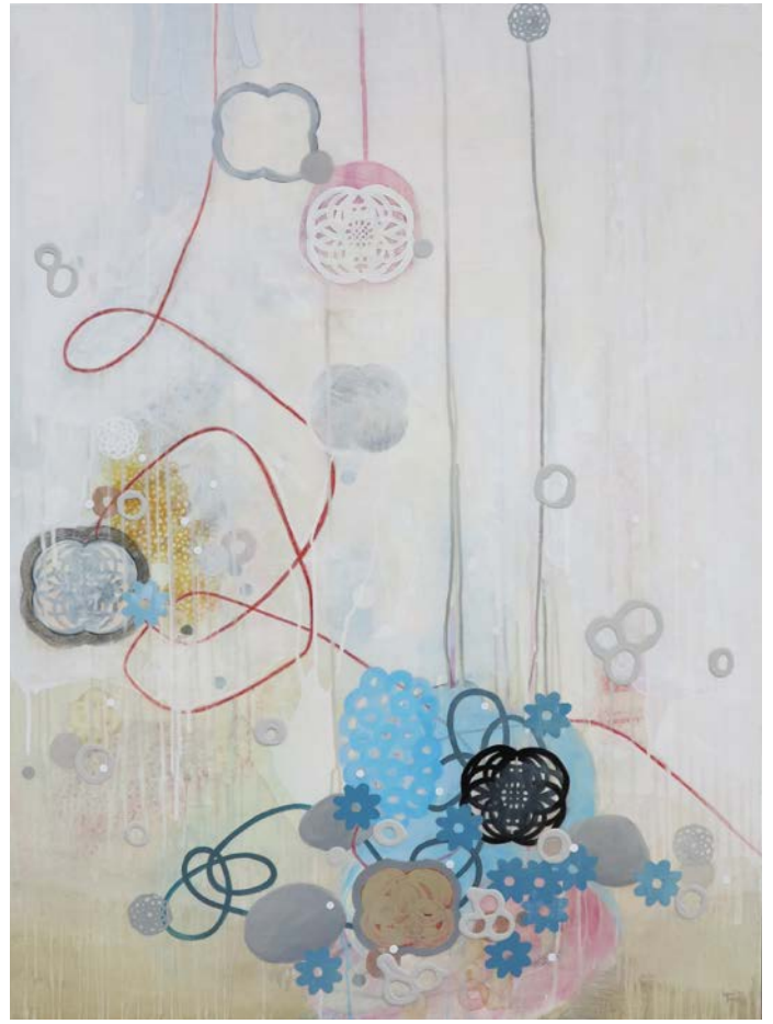
EBULLIENCE 2, 2012, ACRYLIC AND MIXED MEDIA ON PANEL, 102 X 76 CM (40 X 30 INCHES)