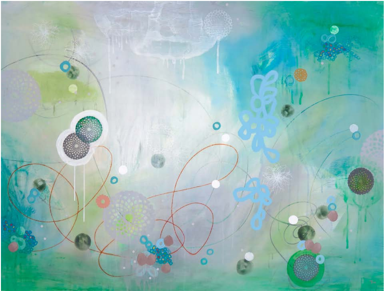
VERDANT SPRING, 2013, ACRYLIC AND MIXED MEDIA ON PANEL, 91.5 X 122 CM (36 X 48 INCHES)