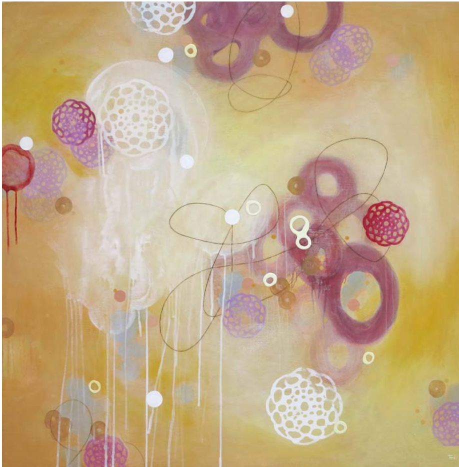
SHINING MOMENT, 2013, ACRYLIC AND MIXED MEDIA ON PANEL, 122 X 122 CM (48 X 48 INCHES)