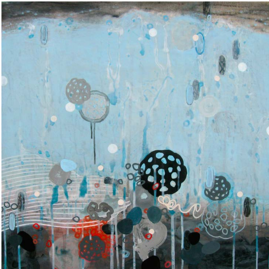
ROCKY ROAD, 2012, ACRYLIC AND MIXED MEDIA ON PANEL, 81 X 81 CM (32 X 32 INCHES)