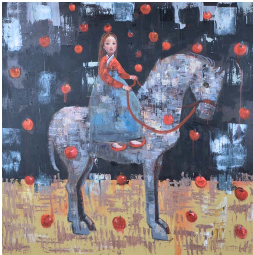
FALLING APPLE, 2012, OIL ON CANVAS, 122 X 122 CM