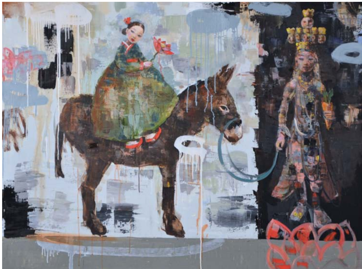
PRAY WITH LOTUS, 2012, OIL ON CANVAS, 91 X 122 CM