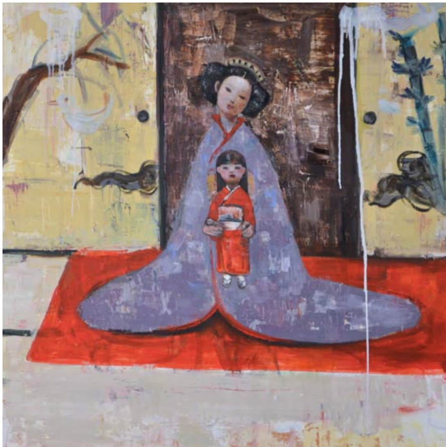
BIRTH OF LOVE, 2012, OIL ON CANVAS, 91 X 91 CM