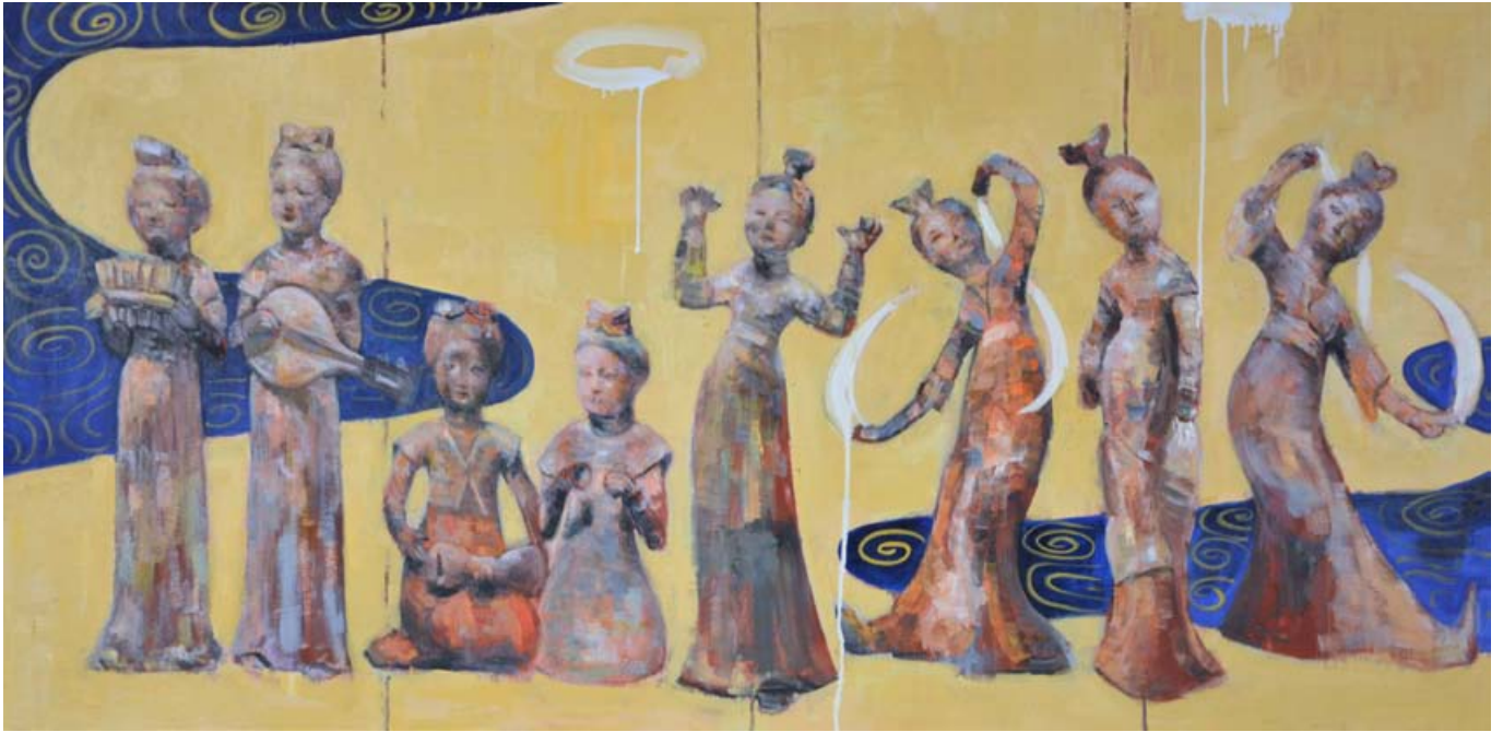
DANCERS AND MUSICIANS, 2012, OIL ON CANVAS, 76 X 152 CM