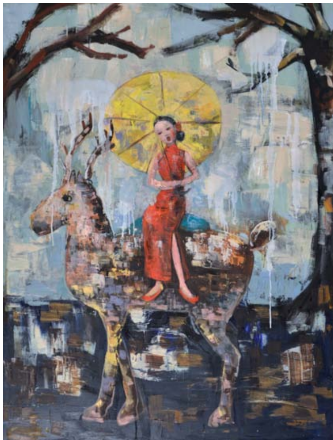
SONG OF LOST LOVE, 2012, OIL ON CANVAS, 122 X 91 CM