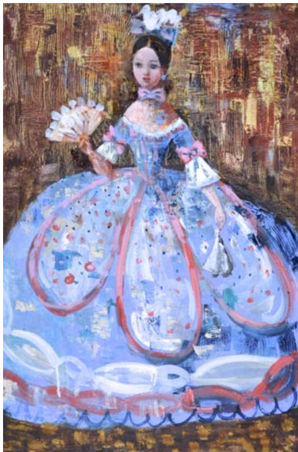
PINK BOW, 2012, OIL ON CANVAS, 91 X 61 CM