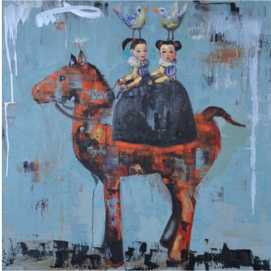
TWO BIRDS AND SISTERS, 2012, OIL ON CANVAS, 91 X 91 CM