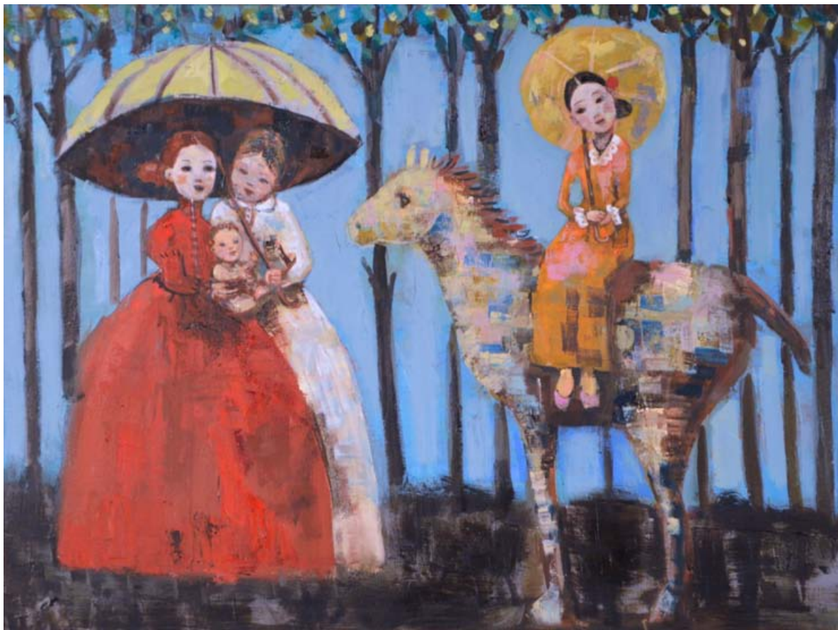
GRACES AND A BABY, 2012, OIL ON CANVAS, 76 X 102 CM