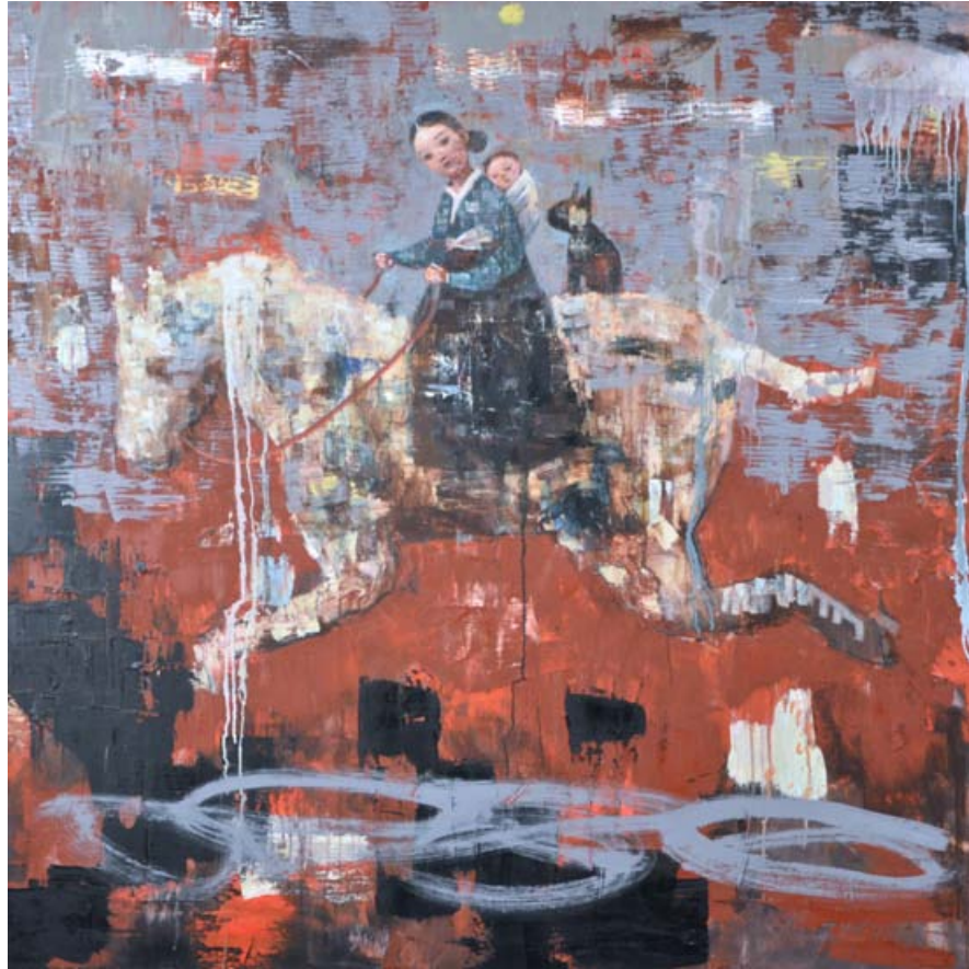
FAMILY'S JOY RIDE, 2012, OIL ON CANVAS, 122 X 122 CM