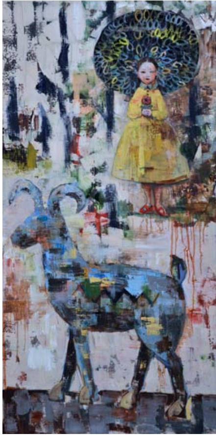
FORREST KING, 2012, OIL ON CANVAS, 152 X 76 CM