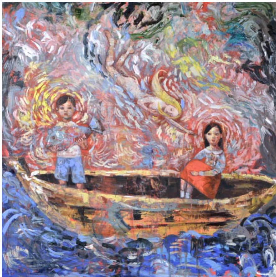
FOREVER CHILD, 2012, OIL ON CANVAS, 122 X 122 CM