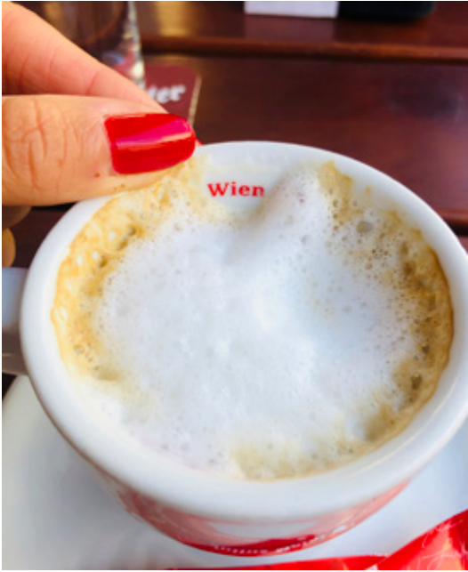
Trip to art fair Parallel, Vienna