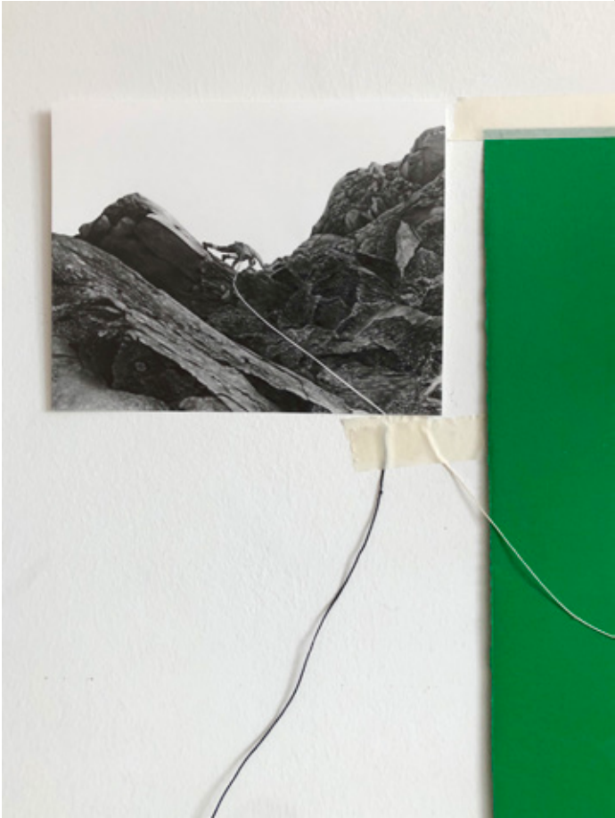
graphite drawing / made in Krems