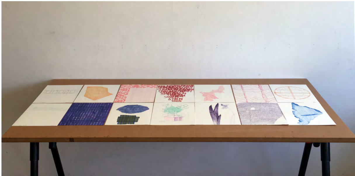
Mixtape, drawings, ongoing project since 2010

Report Cecilia Enberg, April 2017 International Exchange Institution: ÖKKV – Örnköldsviks Kollektiva Konstnärsverkstad, Örnköldsvik, Sweden.