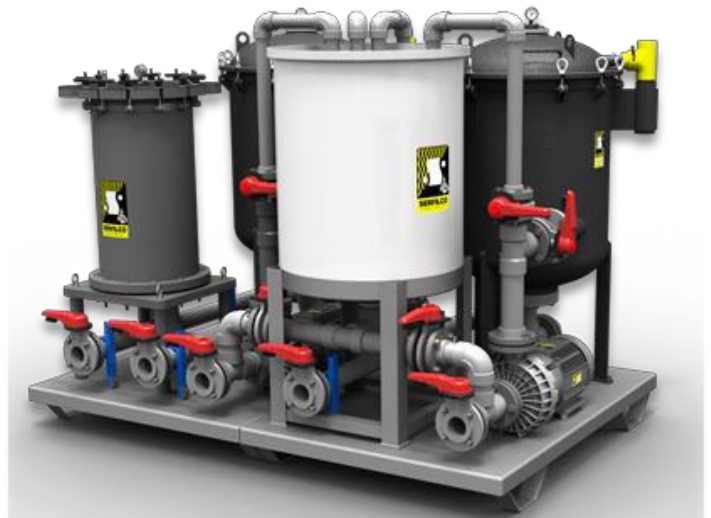
Optiflo with slurry and bypass carbon

Choose a basic filtration system with your choice of media, pump and filter chamber. Then select from a wide range of optional equipment to customize your system. Call us and we'll help you select the perfect system for your application.