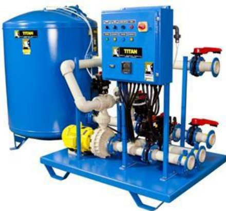
Titan Automatic Filter

SERFILCO filters can accommodate a variety of filter media including cartridges, disks, bags, permanent media or carbon and GAC. The rugged construction features a low pressure drop for long intervals of continuous high flow and long service life.