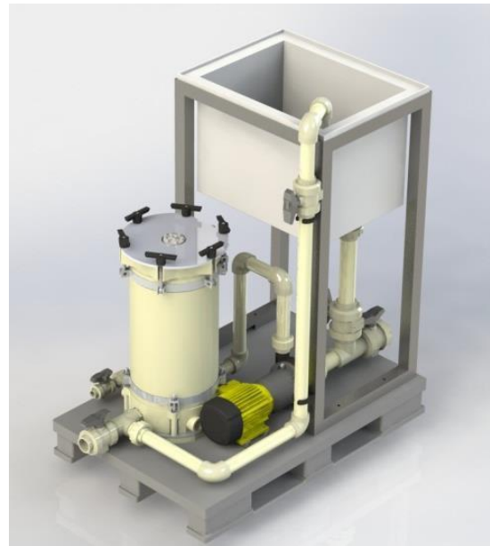
Guardian with optional slurry tank

SERFILCO Filtration Systems are compact, corrosion resistant and extremely simple to operate. A choice of construction materials allows their use with most liquids, including strong chemicals at elevated temperatures.