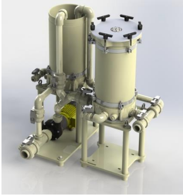
Super Space-Saver with slurry

SERFILCO filters can accommodate a variety of filter media including cartridges, disks, bags, permanent media or carbon and GAC. The rugged construction features a low pressure drop for long intervals of continuous high flow and long service life.