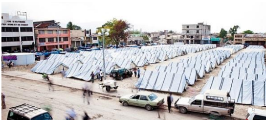
make the world