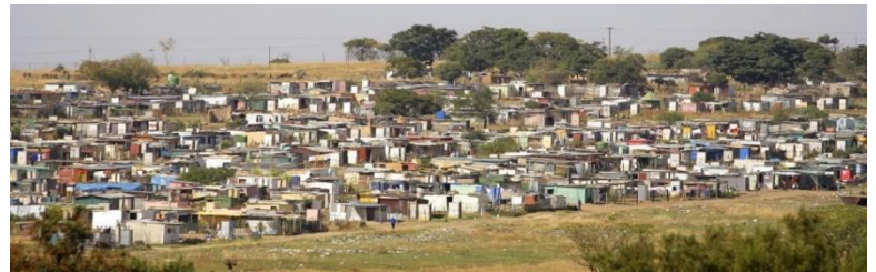
a better place