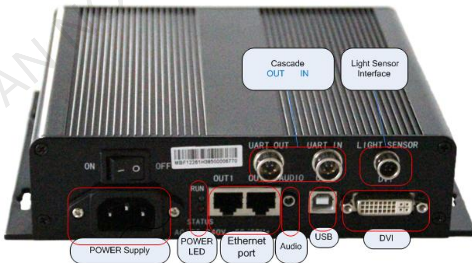
Fig. 2 Interface diagram