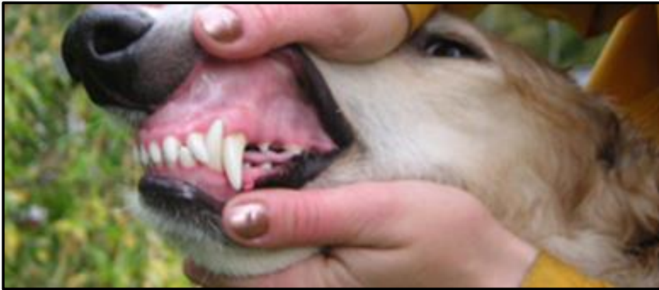
Image 7 Excellent bite with long canine teeth.

As previously mentioned the breed standard states the following as a disqualifying fault "Faulty position of one or both canines of the lower jaw which, when the mouth is shut, can damage the upper gums or the palate". The risk of damaging the palate is obvious with faulty position of lower canines. The interference with the palate/gums must be especially focused.