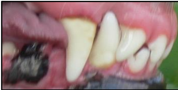
Image 10 Displays a correct bite