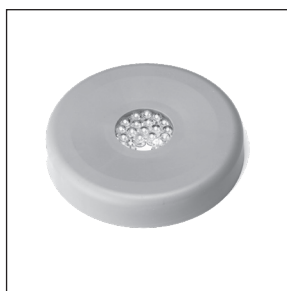
LED-light: Diameter 87 mm Height 16 mm

Wireless powered LED-spotlights in display cabinets, bookshelves, or kitchen cabinets. Get a stylish look hiding away ugly cables completely.