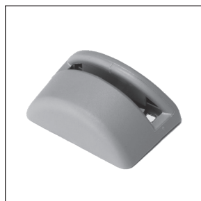
LED-light: 44 x 33 x 17 mm

Wireless powered LED shelf light illuminating glass shelves in display cabinets, bookshelves or kitchen glass shelves. Get a stylish look hiding away ugly cables completely.