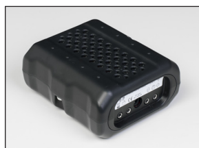
Connection box: 120 x 104 x 55 mm