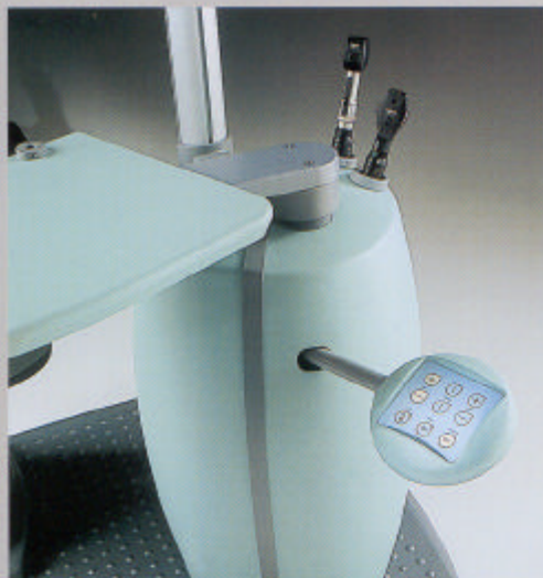
Pannello comandi digitale Digital control panel