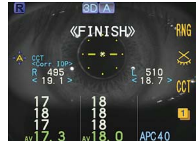
Compensated patient's IOP