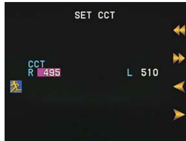
Entered patient's corneal thickness