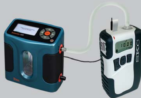
Leland Legacy® in CalChek calibration train