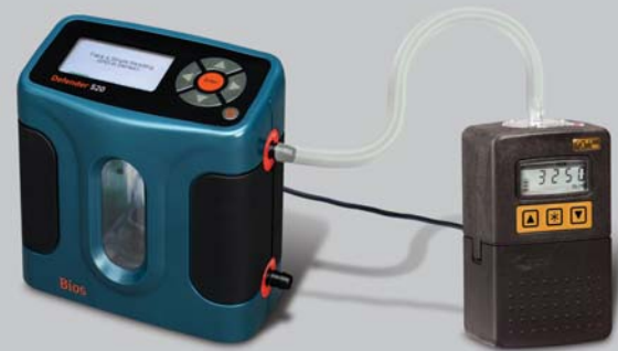
AirChek® 2000 in CalChek calibration train